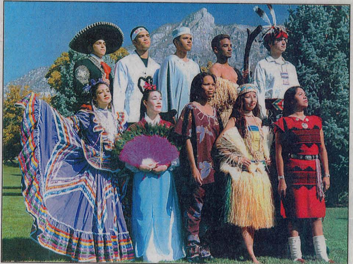
Utah college students model the costumes they will wear when they perform in the ROC Entertainment multicultural show to be held 7 p.m. Saturday, at the Red Rock State Park Auditorium. Entitled Cultural Fx, the show gives the students from diverse cultural backgrounds a chance to showcase traditional and modern dances as they continue their education. The group also will perform in Kykotsmovi and Tuba City, AZ.